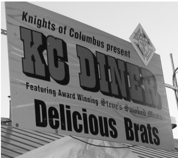
KC Diner, a long tradition at the fair.

This is a list of the Foodstand and Grandstand workers. Please accept our apologies if we overlooked your name. Your help is certainly appreciated.