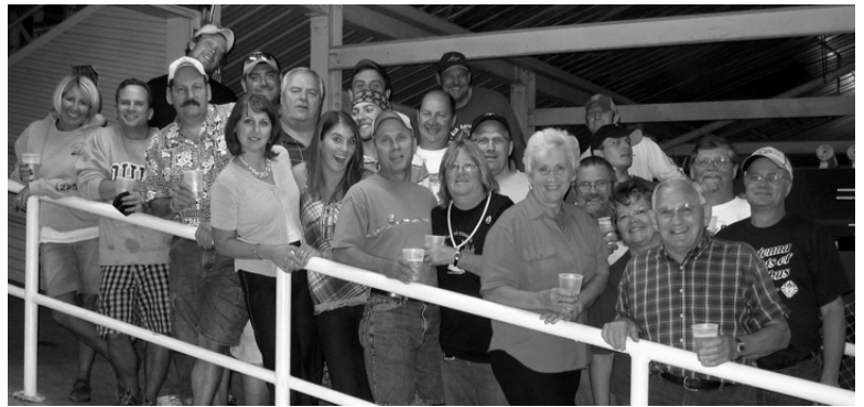
KC Members, family, and friends volunteered their time to work at the Grandstand at the Steele County Fair. A fun time was had by all.