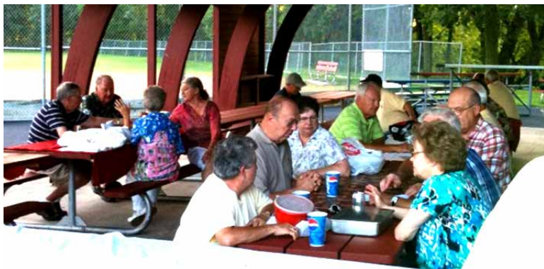
Fourth Degree picnic goes enjoy a great meal of brats, hamburgers, hot dishes, salads, desserts, and beverages.

Remember to stop at the KC Food stand by the beer garden and enjoy a brat or two. Also remember, TEAM Work is everything, TEAM - Together Everyone Accomplishes More.