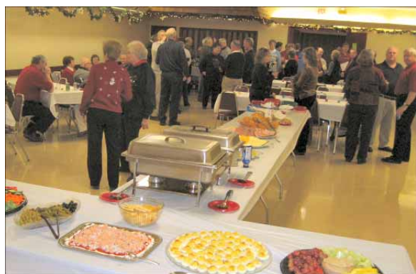
The social hour was enjoyed by all. The tables in the foreground are full of heavy hors d'oeuvres ready for our members to enjoy.